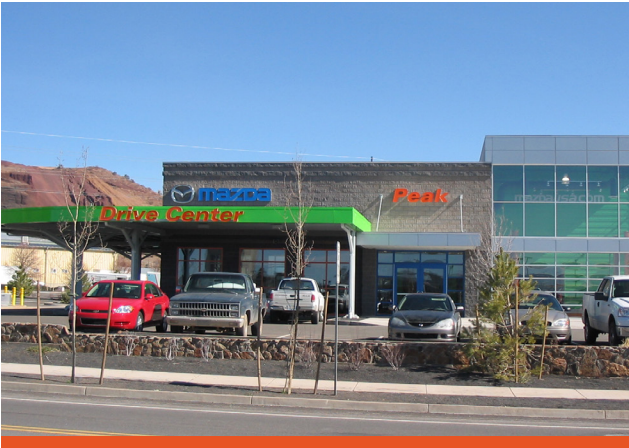
The Peak Mazda Dealership included 190 available parking space for vehicles.