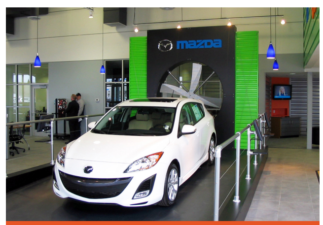
The Peak Mazda Dealership featured several offices, customer lounge areas, a customer café, a retail store, service department, and interior showroom.