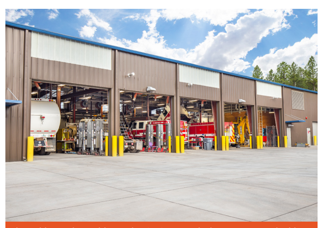
The Public Works Yard hosts the City's new vehicle maintenance building, streets, building, parks building, vehicle fueling facility, cold weather vehicle was building, and administration building.