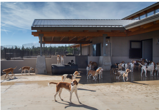
The facility features a kennel capable of housing 100 dogs, veterinary and observation kennels, and exam and grooming spaces.