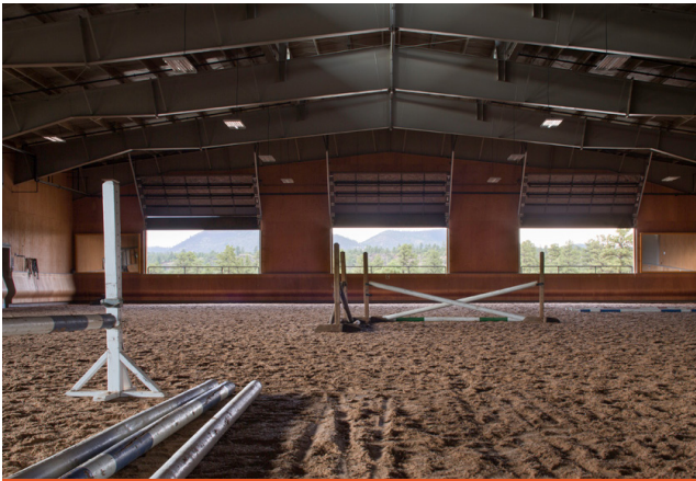
The facility features an expansive 28,000SF indoor riding arena.