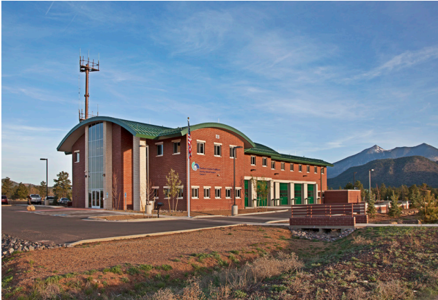
Loven Contracting partnered with Northern Arizona Healthcare to construct the 15,700SF facility.