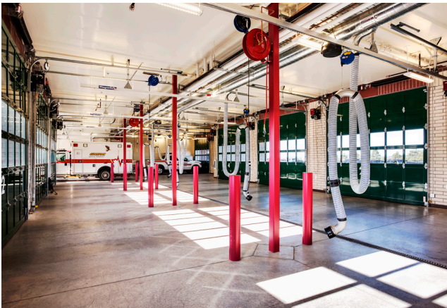
There are twelve vehicle storage bays on-site.

The project design utilized a round roof system. Layout and computer modules were utilized for the installation of the wall anchors, top of wall anchors, and mechanical/plumbing/electrical/sprinkler installations. The roof panels were bent by a portable machine on site to match the arch.