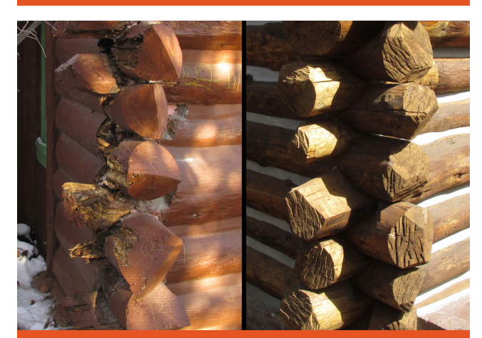
Southeast log crown before and after the preservation process illustrating preserved logs, board and batten wood siding, wood shakes, excavated stone foundation, and the addition of a fully reversible copper gutter and downspout. Great care was taken by our team's carpenters to accurately select all logs for repairs and to duplicate their historic shape and tool marks.

Location: Grand Canyon National Park, AZ