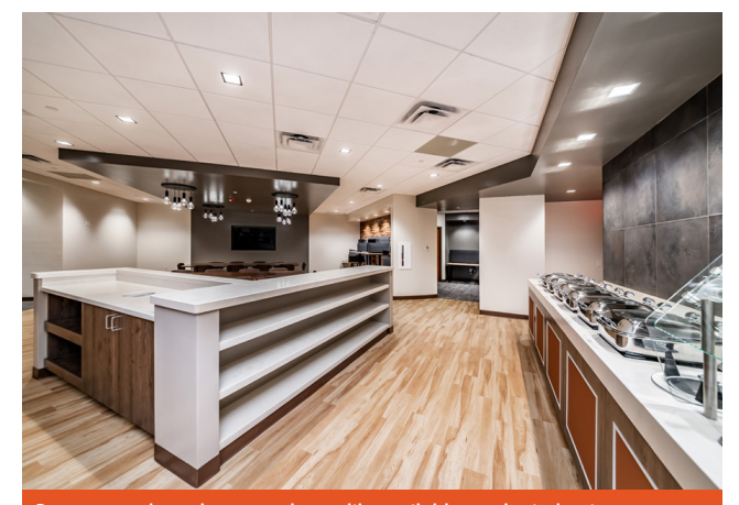
Pre-prepared meals are made readily available on the induction warmers, enabling staff flexibility and meals on-the-go as needed.

and relaxing environment that encourages workplace efficiency.