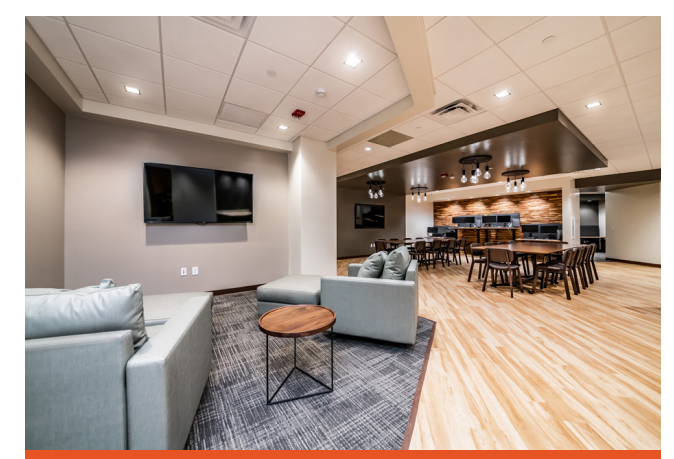
The Physician's Lounge serves as a quiet space with food service, dining, and workspace areas that promote comfort and privacy for healthcare providers.